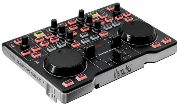
Fig. 1. Hercules DJControl MP3 LE

The second device, the proposed middleware was made to work with, is a MPK mini musical keyboard from Akai, allowing for input multiple keys, but also equipped with 8 knobs, presented in the Figure 2.