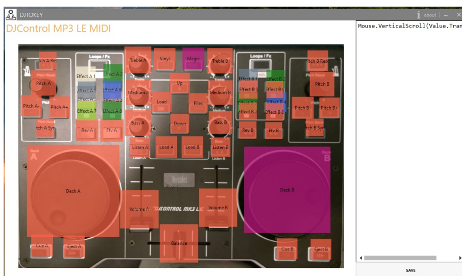
Fig. 4. DjToKey application interface

In the Fig. 4. the screen of DjToKey application with connected DJControl MP3 LE controller is shown, while in the Fig. 5. – the screen of the raster software editing platform with a set of controls, which may be manipulated using provided physical controls, instead of only virtual ones.