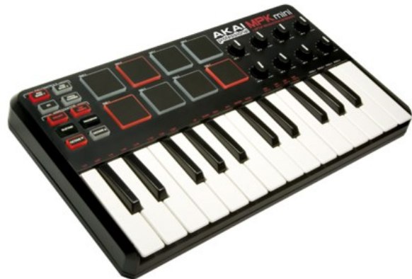
Fig. 2. Akai MPK Mini

The middleware, dubbed “DjToKey”, is a software suite designed for a simple mapping of MIDI messages from the input devices into scripts performed in the operation system [7].